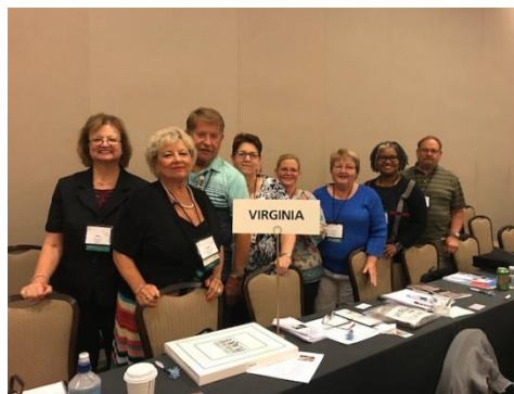
VASSAMT delegates at the business meeting