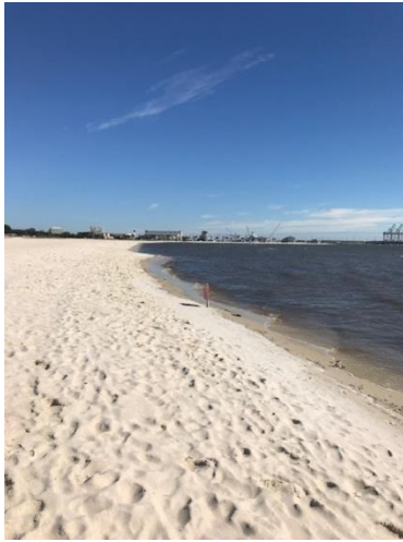
Beach in Gulfport.